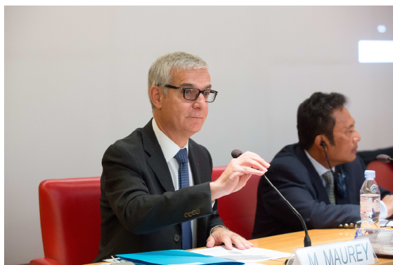
Mr Hervé Maurey, President of the Committee on Land-Use Planning and Sustainable Development

Mr Hervé Maurey recalled that the Senate has committed to fight against climate change, and will host the parliamentary section of the COP21 on December 6, 2015, under the auspices of the Inter-Parliamentary Union. Appointed rapporteur of the World's Parliaments' Statement reviewed at the Senate for the occasion, Mr Hervé Maurey applauded the mobilisation of various bodies of the High Assembly: standing committees, delegations, friendship groups, all of which have embarked on a vast amount of climate-related work.