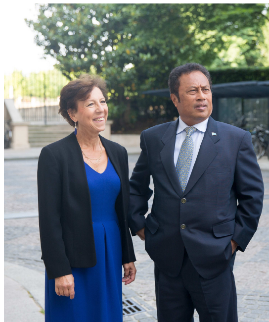
Mr Tommy Remengesau, President of the Republic of Palau, and Ms Catherine Procaccia, President of the France-Vanuatu-Pacific Islands friendship group

He also stressed "the need to place the ocean at the heart of the Millennium Development Goals of the United Nations" . He said that the COP21 must address objectives and challenges not only to the scale of Oceania, but to that of the entire planet.