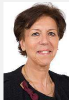
Ms Catherine Procaccia

President of the France-Vanuatu-Pacific Islands friendship group (The Republicans)