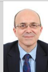
Mr André GATTOLIN Vice-president of the Group Senator for Hauts-de-Seine (Green)

Composition of the Friendship Group: http://www.senat.fr/groupe-interparlementaire-amitie/ami_583.html