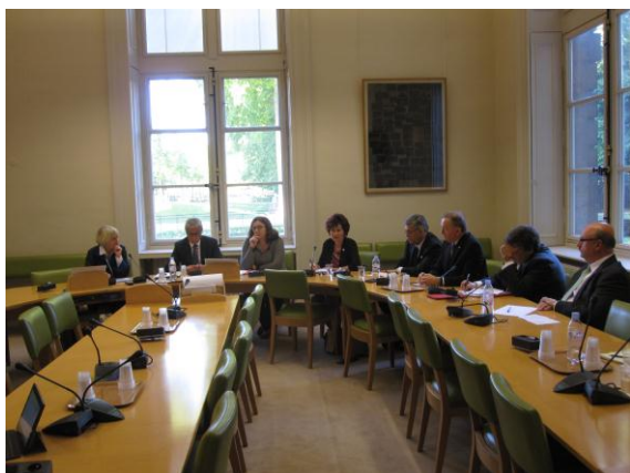
Interview with Mr Hervé Maurey, Chairman of the committee on Sustainable Development at the Senate

Mr Maurey recalled the involvement of parliamentarians, and especially the Senate, in preparations for COP21. He said the Senate had set up a working group on international climate and environmental negotiations.