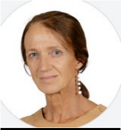
Ms Vanina PAOLI-GAGIN

Member of Parliament (Horizons, Maine-et-Loire) Secretary of the Committee on Foreign Affairs