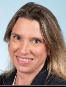
Ms Laetitia SAINT-PAUL

Member of Parliament (Horizons, Maine-et-Loire) Secretary of the Committee on Foreign Affairs