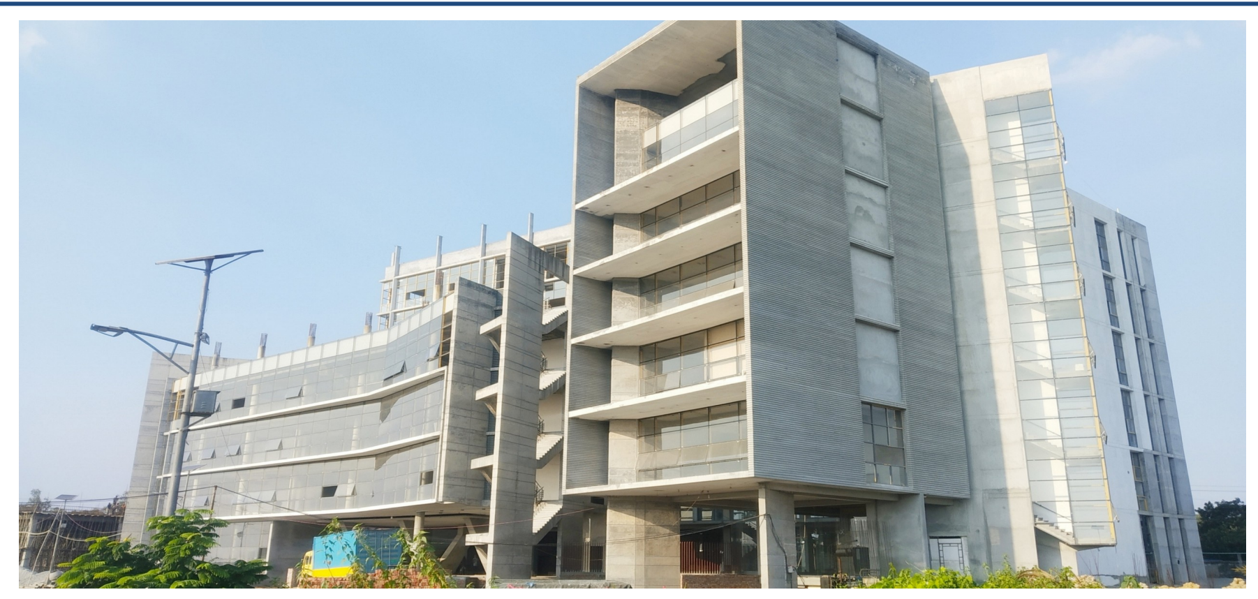
Infrastructure in Bangabandhu Hi-Tech City, Kaliakoir