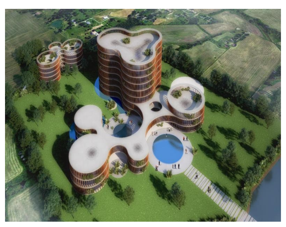
Design of the IT Parks in 12 District