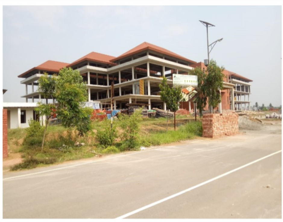
Infrastructure in Bangabandhu Hi-Tech City, Kaliakoir