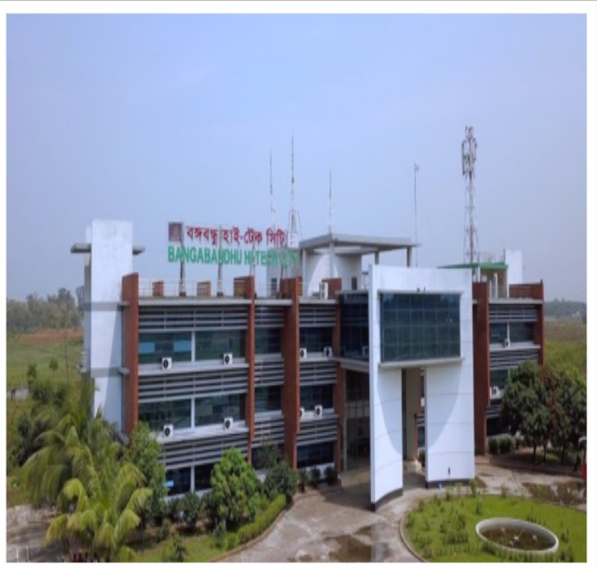
Infrastructure in Bangabandhu Hi-Tech City, Kaliakoir