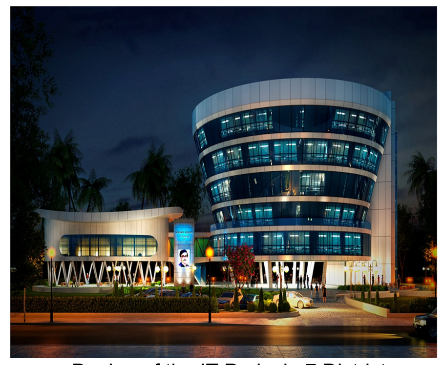
Design of the IT Parks in 7 District (Construction ongoing)